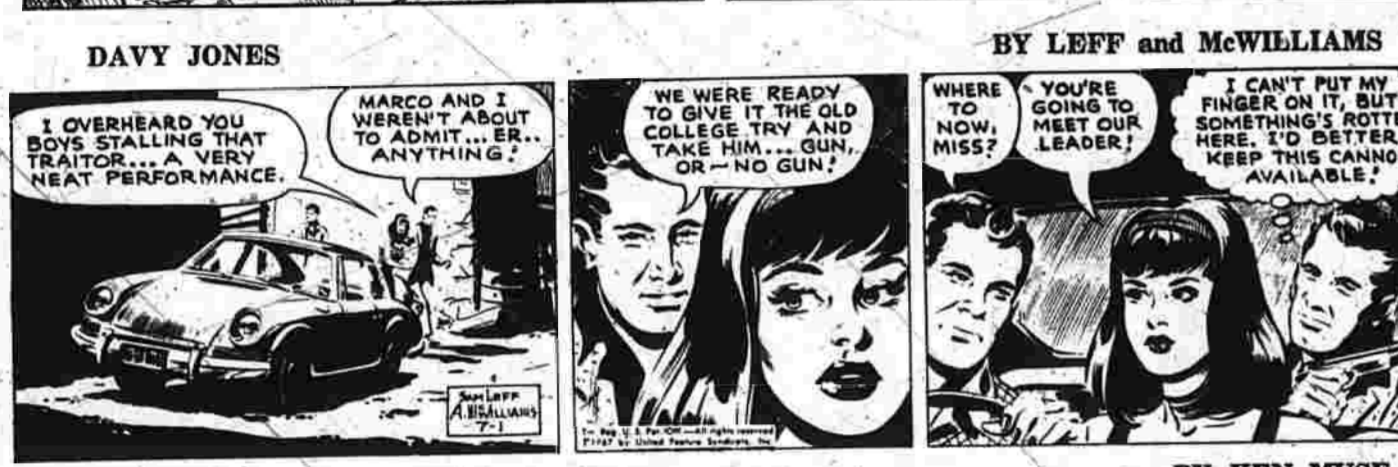
BY LEFF and McWILLIAMS